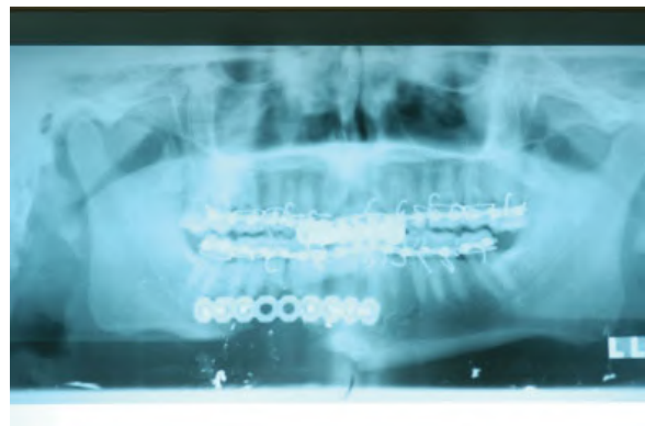
Fig. 3 Radiograph showing maxillomandibular fixation with the placement of reconstructive plate along inferior mandibular border.

fragments. 48-50 Rigid fixation of projected pre-morbid occlusion is initially performed with the use of arch bars, wiring, or acrylic splints. An extraoral approach toward fracture exposure is then performed while maintaining the lingual periosteum when possible to stabilize osseous segments and prevent devascularization. Fracture “simplification” is then performed by fastening smaller fragments into larger segments with the use of miniplates or lag screws. This simplified construct is then further stabilized with the use of a locking reconstruction plate with three or more screws on either side of the fracture ends. MMF may then be removed following internal fixation to mitigate ankylosis. 44,48-50