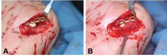
Fig. 4 (A) Mandibular defect with the placement of reconstructive plate across defect. (B) Placement of bone graft with autogenous particulate marrow.

reconstructing large defects. 42,44 A growing understanding of the regenerative capacity of native bone has also led to augmentation with the use of multiple biomolecules that may display summative effects. 56,57