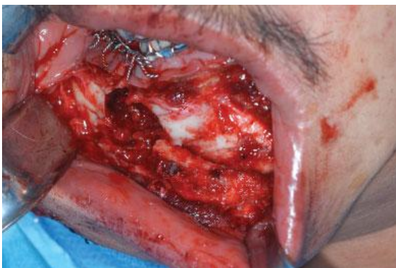
Fig. 1 Intraoperative image displaying continuity defect of mandible following trauma.

Comminuted mandibular fractures are generally the result of high-impact localized injury. Prior series have reported 5 to 10% of mandibular fractures resulting in comminution with high rates of malunion or nonunion. 48,49 Historically, open reduction was not pursued in these fracture types as the risk of vascular compromise of the osseous fragments and resultant sequestration was believed to preclude such intervention. 48 More recently, open reduction and internal fixation techniques have been implemented in these injury patterns (►Figs. 1-3). Rigid fixation of osseous fragments decreases sequestration while promoting an earlier return to function. 48-53 The entire comminuted fracture complex is exposed and plated using load-bearing osteosynthesis. Non-viable fragments are debrided and the resulting defects are bone grafted. Stabilization with use of load-sharing plates is contraindicated due to the inability for compression of small