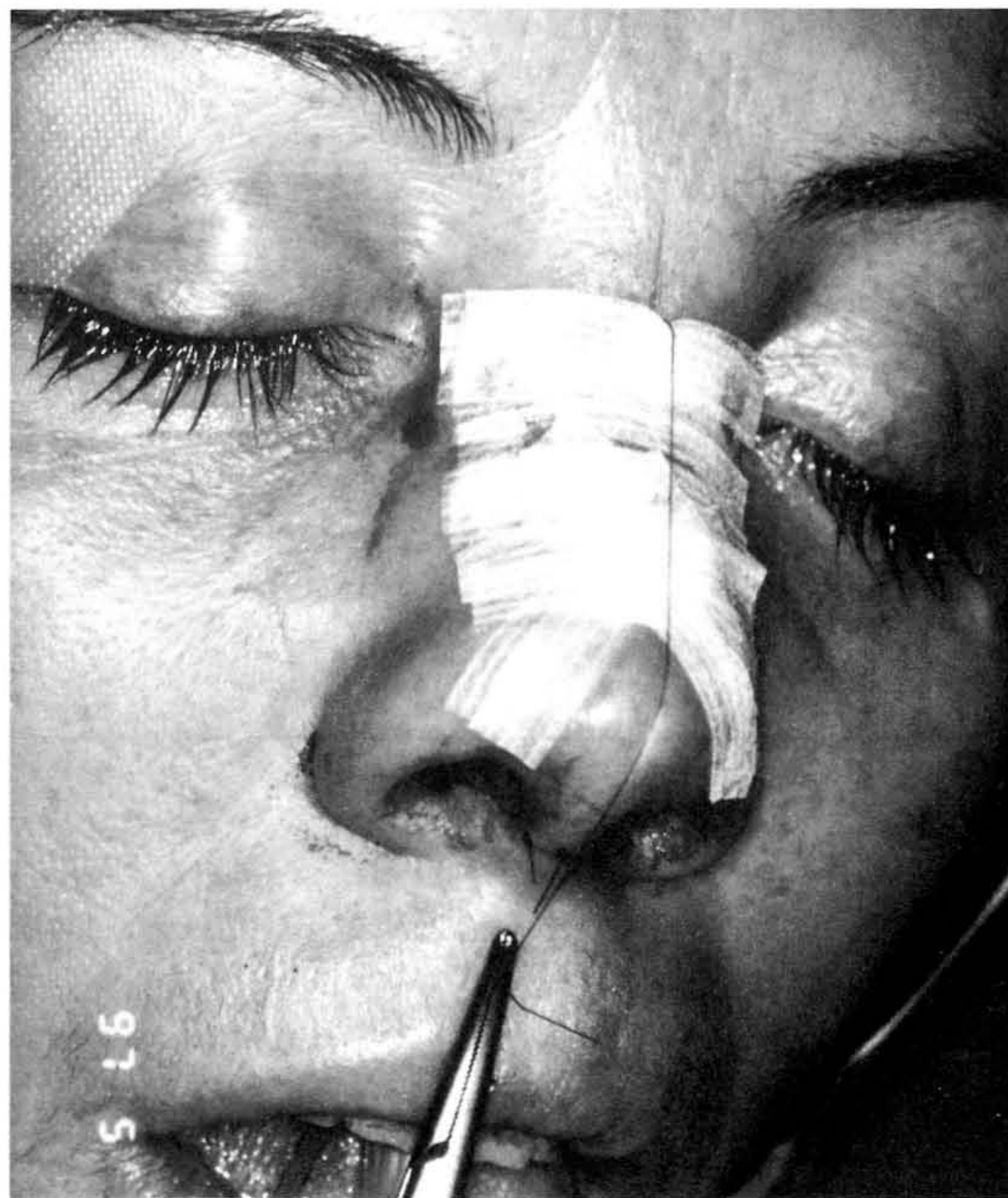
Figure 3. Dorsal nasal steristrips being applied while tension is maintained on retention suture. A second layer of steristrips on top of the suture will assure maintenance of tension on the intranasal bolster.

Surgicel is oxidised regenerated cellulose that is most often used as an absorbable hemostatic agent. When it is secured in position as described, it molds quite nicely to the undersurface of the nasal bone or nasal bone fragments. In the immediate postoperative period, it will desiccate forming a firm cast as support for the nasal bones. No nasal packing is necessary to maintain its position. Thus, airway patency is assured and patient comfort increased. At the time of removal of the external nasal dressing (steristrips and thermoplastic dressing) the short segment of the transcutaneous PDS suture is trimmed flush with the skin of the nasal dorsum. The intranasal Surgicel bolster is allowed to pass on its own. This generally occurs by the end of